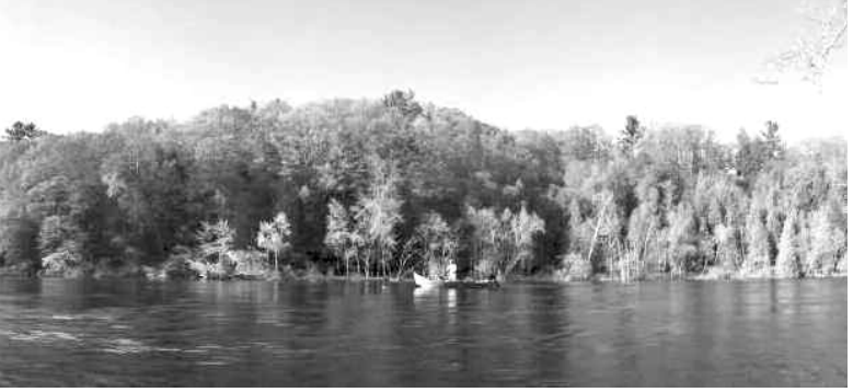
Even though Michigan offers great fishing opportunities 365 days a year, the thrill of spring fishing is rapidly approaching as anglers get ready to hit the water.

The Michigan Department of Natural Resources reminds anyone who fishes to dust off their gear and get ready for the opening of multiple fishing seasons Saturday, April 29. The statewide trout season and the Lower Peninsula inland walleye, northern pike and muskellunge seasons all open that day.